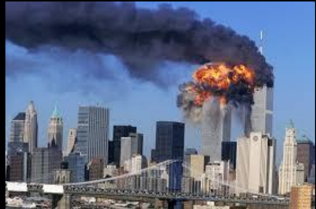
Twin Towers Burning

The conflicts, regretfully, are not limited to international arena. There is rising phenomenon of mass protests across the globe. It is an equal-opportunity discontent, shaking countries governed by both the left and right, democracies and autocracies, rich and poor, from Latin America to Asia and Africa. And there are ethnic conflicts - ranging from the Protestant-Catholic conflict in Northern Ireland and Hindu-Muslim conflict in our country to black-white conflict in the United States and South Africa, Tamil-Sinhala conflict in Sri Lanka, the Shia-Sunni conflict in Pakistan, or the ethnic fights in Bosnia, Yemen, Ethiopia or some other African countries. United Nation do send Peace Keeping Forces – with arms or without – to control the outbursts, but the animosity smoulders on. There also are instances of Big Brothers joining the cauldron in that role, but ultimately extricating itself with difficulty, at times leaving behind unpleasant memories. Middle East . . . Sri Lanka . . . These clashes, based on ethnic identities and fighting for independence or increased socio-political, or economic power resist compromise, arouse passion instead of reason, and the conflict lingers on.