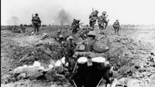
First World War

The Arab-Israeli conflict could be settled amicably, but alas, there were and are a number of international conflicts globally, claiming millions of lives. Decades of treaties and tensions between the nations of Europe and western Asia culminated in the First World War that left 30 million dead, and the imposition of severe economic sanctions and debt-repayment obligations on Germany and the other Central Powers which in its turn fed a festering resentment in Germany.