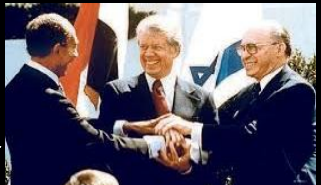
Sadat, Begin and Carter at Camp David

The ice broke. Series of negotiations followed, leading to the 1978 Camp David Accords, facilitated by US President Jimmy Carter – a momentous step that won Sadat Nobel Peace Prize in 1978 and assassin's bullets on 6th October 1981.