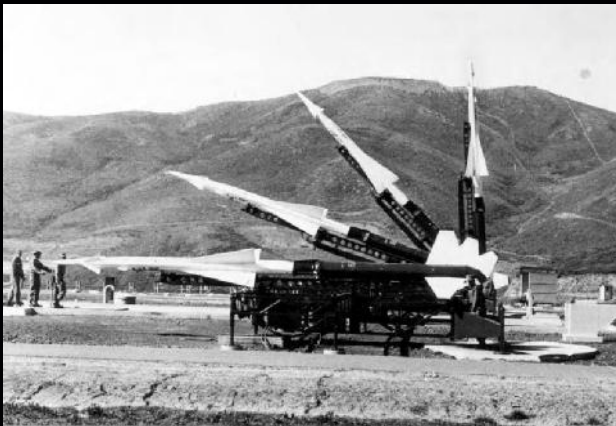
Ready !! Cold War

Adolf Hitler and his team started twisting German folklores and traditions, and with the help of an excellent propaganda machinery achieved good public support with jingoistic fervor. He invaded Poland in 1939 and the Second World War started, claiming about 70 million lives. The victorious Allies no more remained united. Two power centres emerged – USSR and USA – both strategically poised to take advantage of the war's aftermath for economic and political gain, but wary of one another, espousing communism and capitalism respectively.