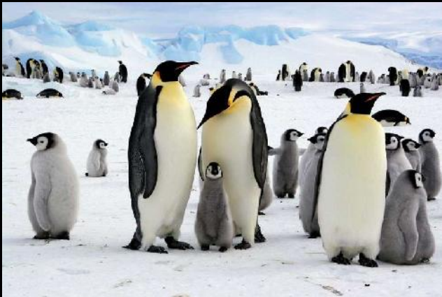
The Frozen Continent – in dispute

to Asia Minor and the Levant, where they would do battle with Islamic forces in an attempt to gain control of the Holy Land. In today's world, Jihad armies are fighting back, burning France and etching in our memory the destruction of Twin Towers on 11th September 2001.