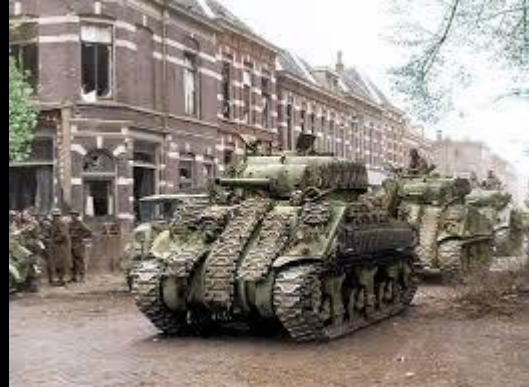
Second World War

Adolf Hitler and his team started twisting German folklores and traditions, and with the help of an excellent propaganda machinery achieved good public support with jingoistic fervor. He invaded Poland in 1939 and the Second World War started, claiming about 70 million lives. The victorious Allies no more remained united. Two power centres emerged – USSR and USA – both strategically poised to take advantage of the war's aftermath for economic and political gain, but wary of one another, espousing communism and capitalism respectively.