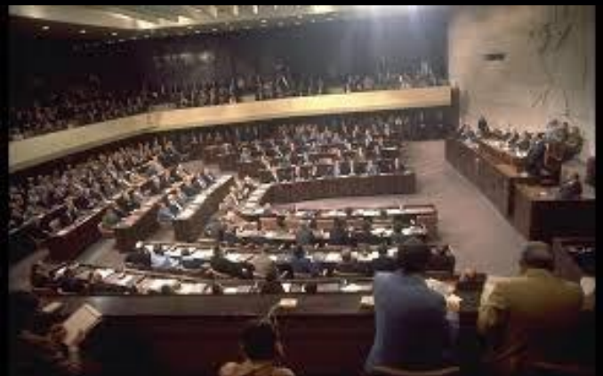
President Sadat at Knesset, Jerusalem

Sadat had an official meeting with Israeli Prime Minister Menachem Begin, and then addressed the Knesset in Jerusalem on the 20th November about his views on how to achieve a comprehensive peace to the Arab-Israeli conflict, which included the full implementation of UN Resolutions 242 and 338.