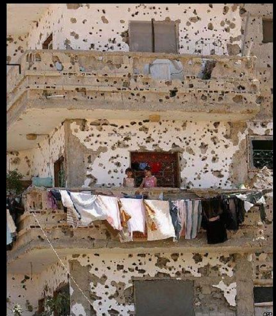
Pockmarks of Machinegun - Middle East

Here comes the role of civil society. In villages in our country less than 4 percent of all deaths and roughly 10 percent of all Hindu-Muslim riots are on record during 1950 to 1995. Peace was maintained because everyday civil engagement between Hindus and Muslims was enough to keep potential rioters away. In cities, however, such everyday engagement was not enough and purposeful involvement of sane minds – without coloured glasses of cast, religion or political belief - were required.