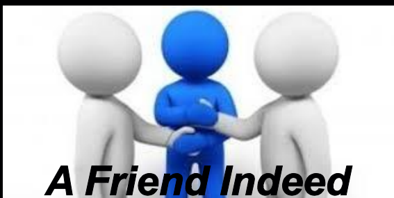
A Friend Indeed

The conflicts, regretfully, are not limited to international arena. There is rising phenomenon of mass protests across the globe. It is an equal-opportunity discontent, shaking countries governed by both the left and right, democracies and autocracies, rich and poor, from Latin America to Asia and Africa. And there are ethnic conflicts - ranging from the Protestant-Catholic conflict in Northern Ireland and Hindu-Muslim conflict in our country to black-white conflict in the United States and South Africa, Tamil-Sinhala conflict in Sri Lanka, the Shia-Sunni conflict in Pakistan, or the ethnic fights in Bosnia, Yemen, Ethiopia or some other African countries. United Nation do send Peace Keeping Forces – with arms or without – to control the outbursts, but the animosity smoulders on. There also are instances of Big Brothers joining the cauldron in that role, but ultimately extricating itself with difficulty, at times leaving behind unpleasant memories. Middle East . . . Sri Lanka . . . These clashes, based on ethnic identities and fighting for independence or increased socio-political, or economic power resist compromise, arouse passion instead of reason, and the conflict lingers on.