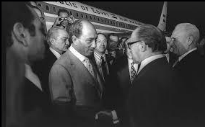
President Sadat at Ben-Gurion Airport, 19th November 1977

The door opened, and from the aircraft emerged Muhammad Anwar el-Sadat. The waiting high-power delegation on the tarmac of Ben-Gurion Airport in Tel Aviv, assembled on diplomatic compulsion on that chilly Saturday night of 19th of November 1977, were a bit startled with warm hugs from Sadat, President of Egypt – their sworn enemy since 1948. This is the very person who ordered his troops into the Sinai Peninsula, triggering the Yom Kippur war to revenge the drubbing in the Six-Day War of 1967.